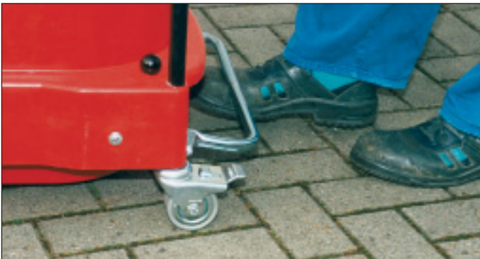
Easy to use thanks to foot bar emptying method