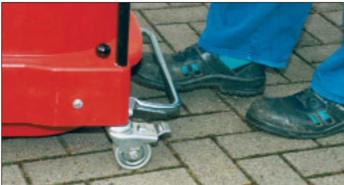
Foot lever actuated dust pan